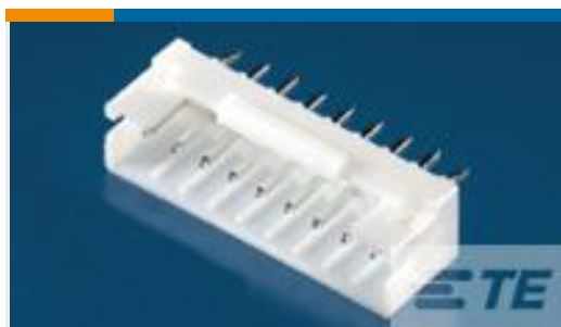
TE Part # 1-1735446-2 2MM PITCH HPI POST HEADER, VERTICAL, 12P